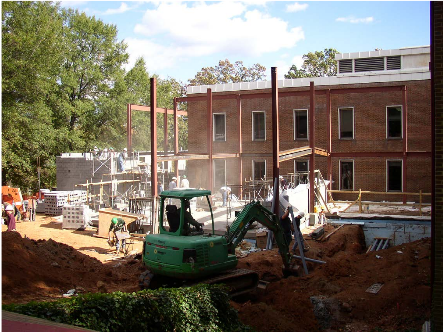
ER Addition was built in 2003-2005 as work went on in the original ...