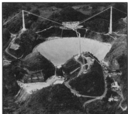
Arecibo listening to distant galaxies.